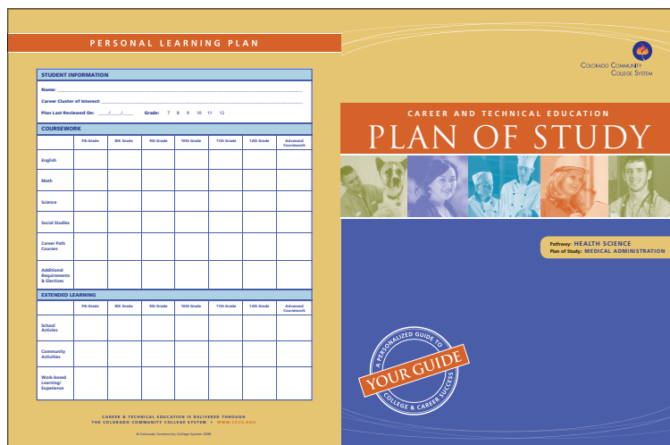
Back cover/ Front cover

Please contact Terra Brown at 303.703.9807 or terrabrown@qwest.net